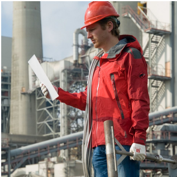
Figure 4 we provide many different models of heat flux sensors for different applications: the picture shows a typical boiler fouling sensor for electrical power plants.