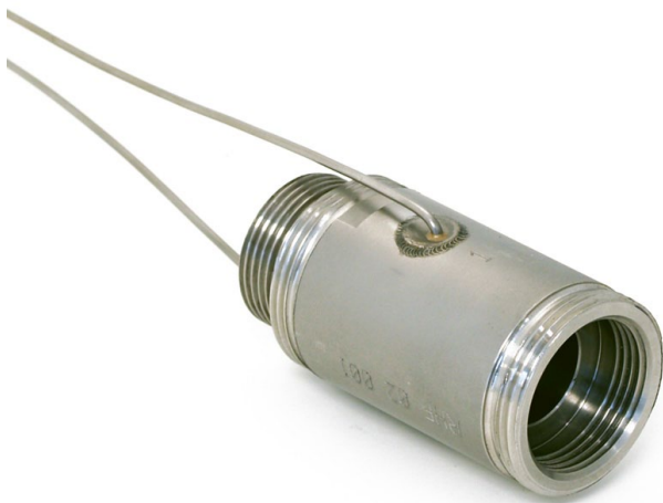
Figure 1 example of an RHF series version with 2 x heat flux and temperature sensors and high temperature metal sheathed cables.

The RHF series consists of customer-specific heat flux sensors incorporated in a stainless steel ring. They are used as building blocks in larger measuring systems, for example to study fouling and slagging in combustion processes. Many RHF's are eventually part of so-called "deposition probes" or "fouling sensors" designed by the customer. It is particularly suitable for trend monitoring that is necessary for this application. A typical sensor contains 4 separate heat flux and 4 temperature sensors, so that fouling behaviour can be studied at different locations on the sensor at different angles relative to the local gas flow.